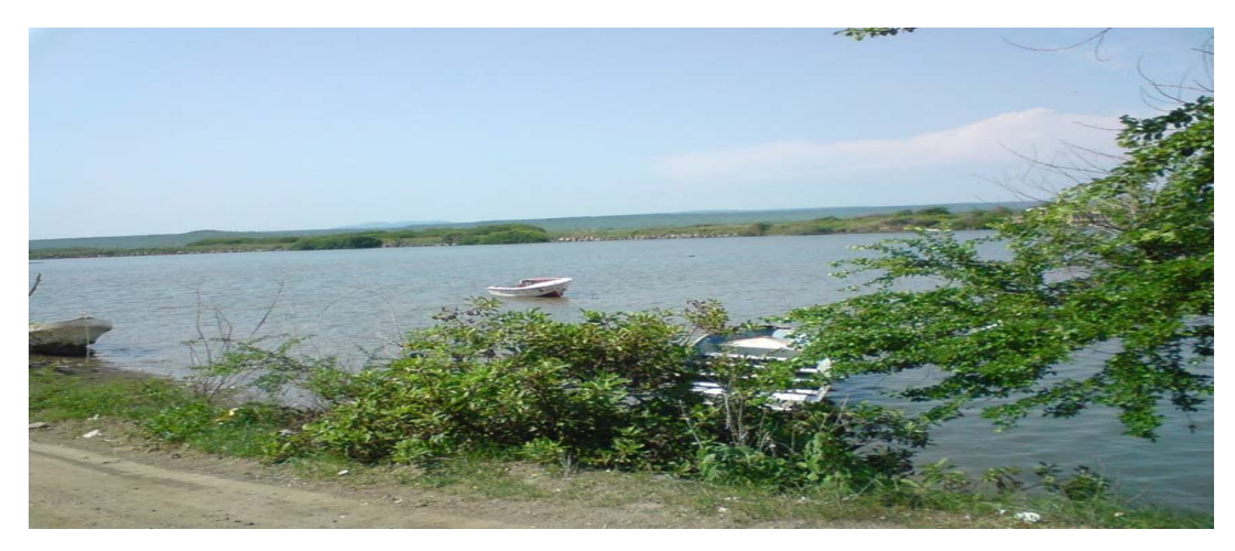
Figure No. 1. The fishing camp "The Tazajal"

Access by the international road is at number fifteen to forty-eight kilometers from the port of Mazatlan. The route has thirty six kilometers of paved road and dirt road twelve kilometers from 1.5 kilometers away from the town of Mármol, Sinaloa. On the road Maxipista at twenty kilometers from Mazatlan to Culiacan and about ten kilometers of dirt road, as it is shown below in figure two.