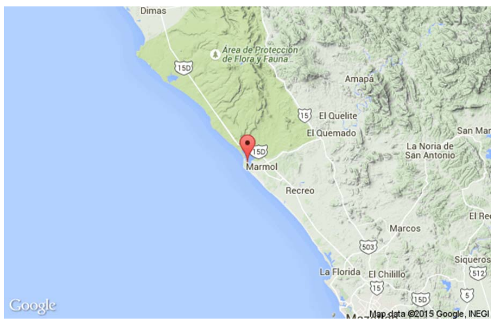
Figure No. 2. Location of the Cooperative Society The Patole with respect to the surrounding villages and the road network

Access by the international road is at number fifteen to forty-eight kilometers from the port of Mazatlan. The route has thirty six kilometers of paved road and dirt road twelve kilometers from 1.5 kilometers away from the town of Mármol, Sinaloa. On the road Maxipista at twenty kilometers from Mazatlan to Culiacan and about ten kilometers of dirt road, as it is shown below in figure two.